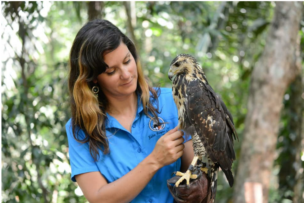
Jennie of the Jungle