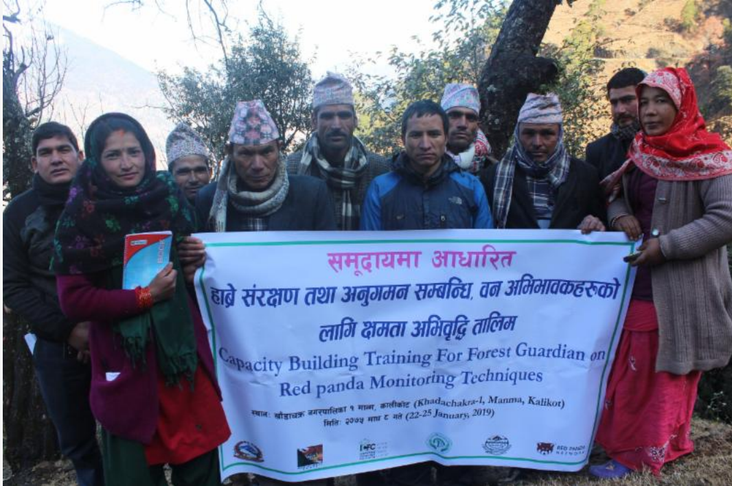
Participants of training in Manma, Kalikot district.