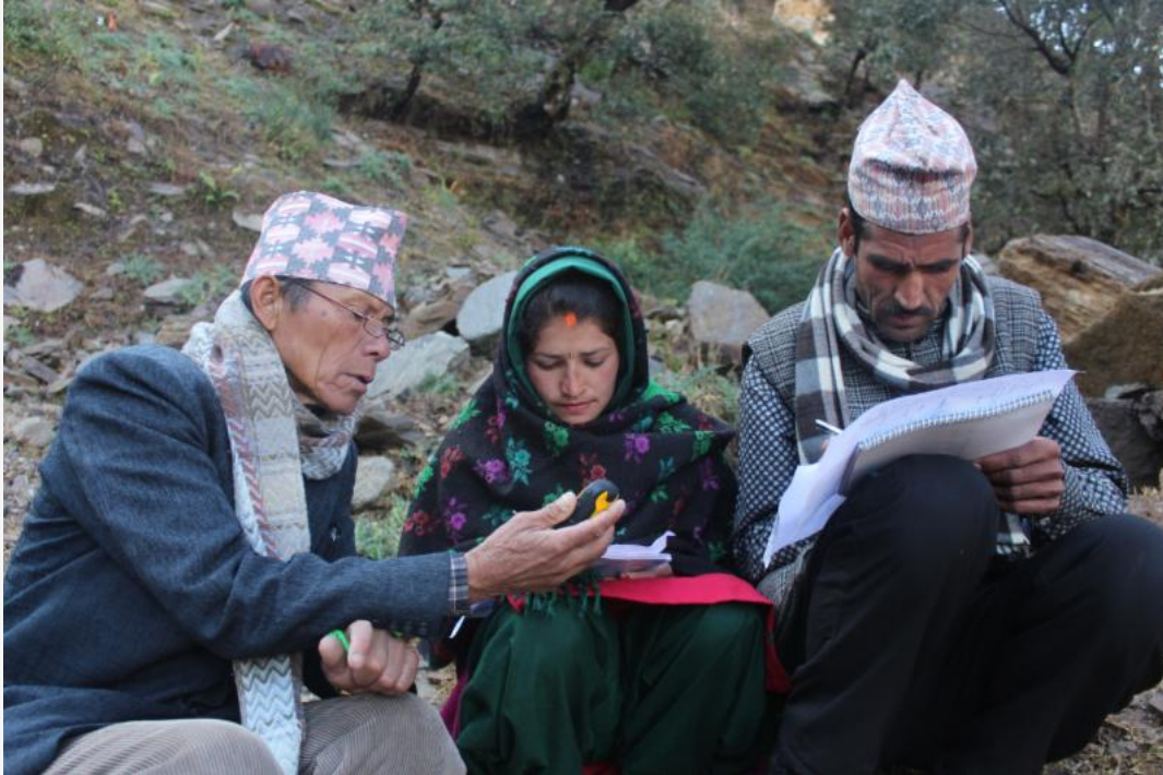
New FGs during capacity-building training.

RPN started the FG program in 2007 as part of a sustainable livelihood initiative to provide local people with financial opportunities that are alternatives to forest exploitation. Presently, a total of 96 members from various CFUGs across the country are working as FGs to support red panda conservation through activities such as monitoring red panda populations and habitat, outreach and education, identifying threats and developing threat mitigation strategies. They are also actively engaged in our anti-poaching network.